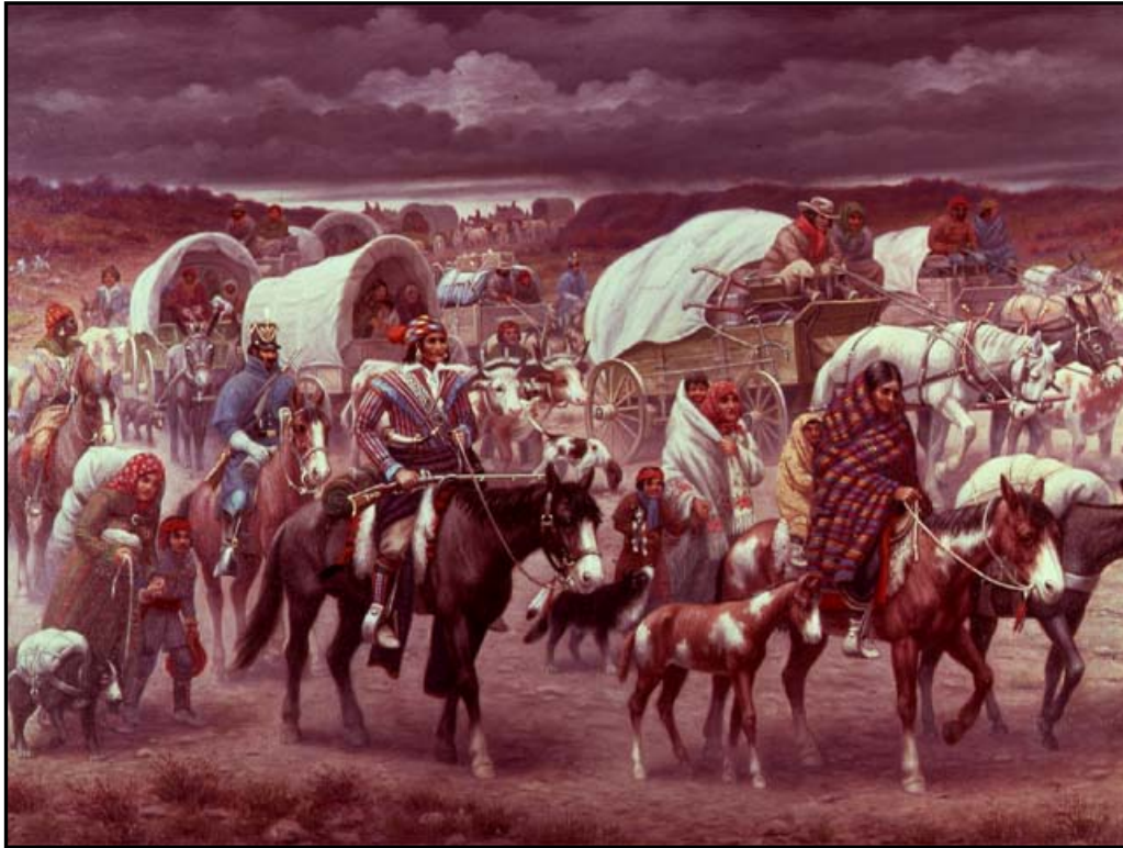
"The Trail of Tears" Painting by Robert Lindneux in the Woolaroc Museum, Bartlesville, Oklahoma

The genocide of peoples indigenous to the U.S. portion of North America proceeded along different tracks, each defined by the policies of the colonial power pursuing it. The colonization began in 1607 when England's Jamestown colonists arrived in present-day Virginia with instructions to "settle" the already heavily populated coastal area. Beginning in 1830, the U.S. undertook a policy of "removing" all native people from the area east of the Mississippi River. In the series of interments and thousand-mile forced marches which followed, entire peoples were decimated. The Cherokees, for instance, suffered 50 percent fatalities during the "Trail of Tears"; the Choctaws, Chickasaws, Seminoles and Creeks, 25 to 35 percent apiece.